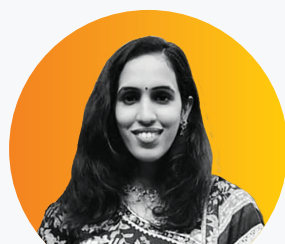
Raksha Singh Podar International School Salary: ₹ 4.80 lakh/yr